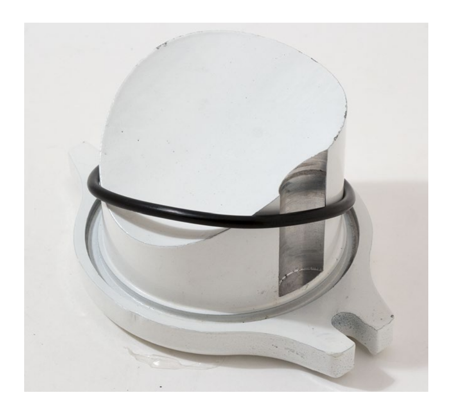
Install the o-ring on the 150-7000 cover and drop it down in the hole (fig3).