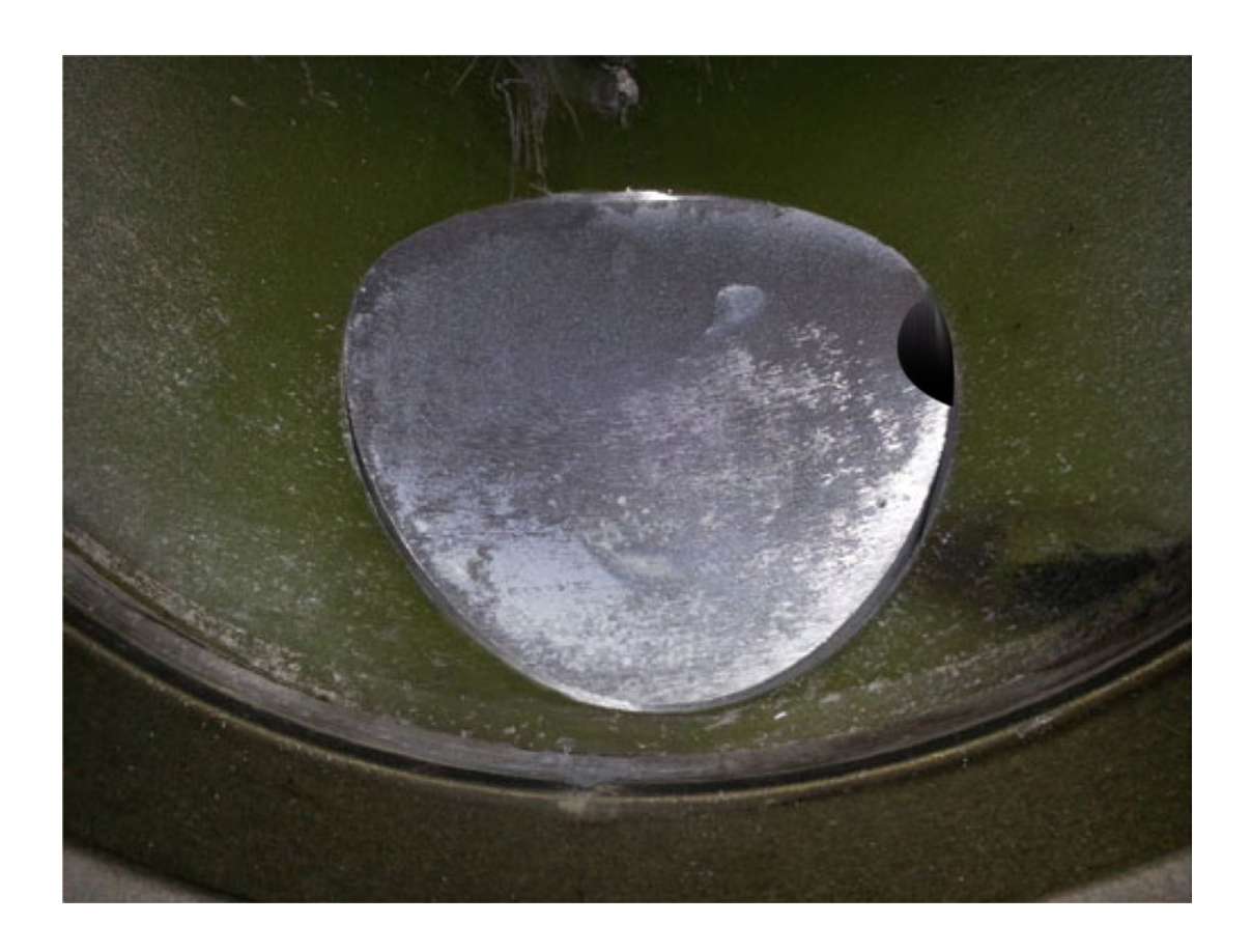
Due to some variations in castings you may have to match the cover to the radius of your pump. This can be done by grinding the cover to match the pump radius, this will give you a nice clean flow of water(fig4).