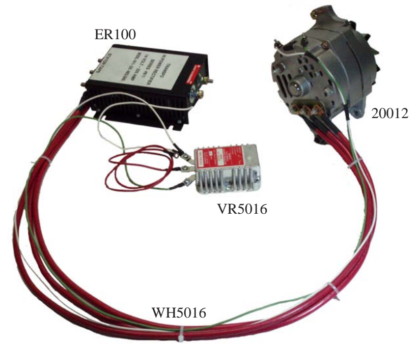
For use on diesel engines only

Complete Kits Includes Alternator # 20012 External Voltage Regulator # VR5016, External Rectifier # ER100 & Wire Harness # WH1200