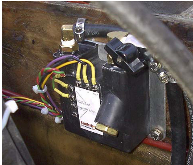
An example of the module and metering valve mounted to the back of a rear seat base. Notice that the filter screen is pointing down and both the filter and the metering valve are easily accessible.

The water Injection module has been designed to be mounted with 1/4" bolts. The module should be located in a dry location, right side up and the filter screen must be accessible. You MUST use the rubber grommets when mounting the module. Why? Because, although the epoxy that the module is encased in makes it impervious to just about everything on the planet.. The one thing it can not take, is flexing. Forcing the base plate to flex or twist will kill the module faster than anything. The rubber grommets supplied on the base plate solve this problem by giving the mounting bolts some room to move about. Locate a suitable location for mounting The Water Injection Module and the metering valve.